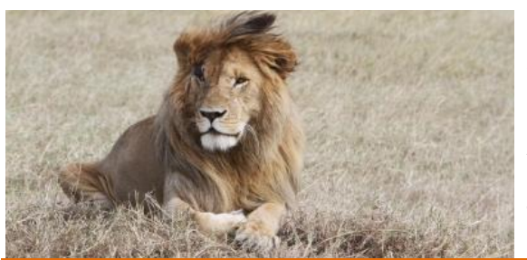
THURSDAY, 15 AUGUST 2013 Masai Mara / Nairobi

This morning is our last chance to search for any of the species we have not yet seen, and for a possible last-minute river-crossing on the Mara Waterfront.