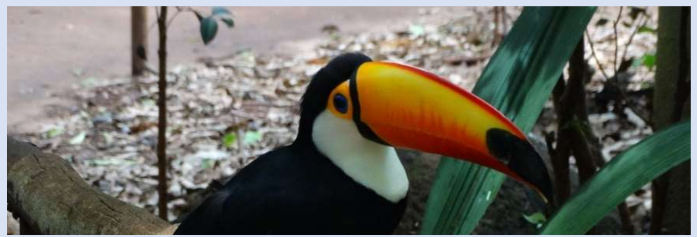
We fly back to Buenos Aires on time for our international flights home, enriched with memories of some of the world's greatest wonders!

We also visit the Exotic bird park, home to one of the greatest collection of parrots and Tucons in the world, many indigenous to the region, and some of which we hope to see in the wild in the park as well. This park is a world in its own right, and one even can even get the opportunity to have a photo taken with a Toucan!